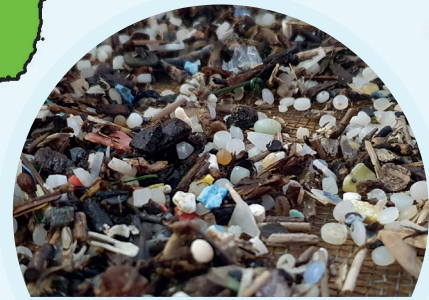
EUROPE: 3,269 Nurdle Hunts