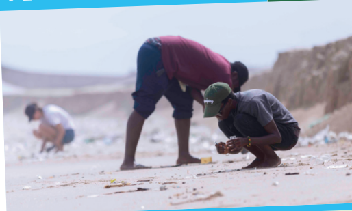
Top: A Greener Future have organised nurdle hunts along the shores of Lake Ontario, Canada