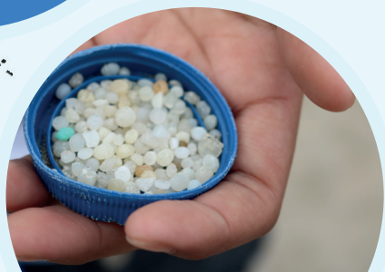
S. AMERICA: 50 Nurdle Hunts