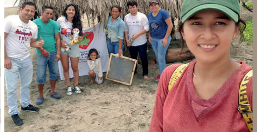
Left: NGO A Rocha Kenya have conducted 14 nurdle hunts since 2018 with local communities.