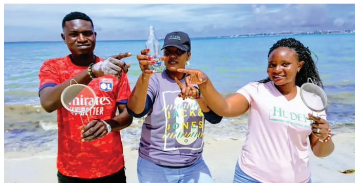
HUDEFO reported the first nurdle results from Tanzania

This year 58 amazing organisations took part in the hunt. We want to thank everyone who organised a nurdle hunt and the 849 volunteers who took part around the world, your efforts equated to over 32 continuous days of nurdle hunting!