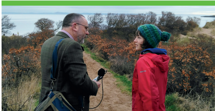
A nurdle hunter being interviewed by the BBC in 2017.

Collectively we have taken nurdles into parliaments, courtrooms and to the media to increase awareness and present evidence of the issue to decision makers. Data collected by nurdle hunters has helped inform briefings, submissions, consultations and reports, all important tools in driving change.