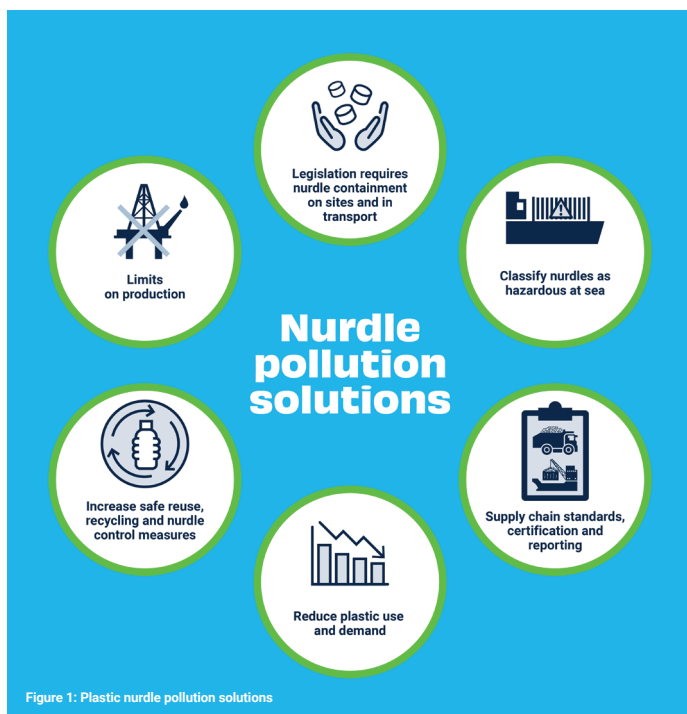
Figure 1: Plastic nurdle pollution solutions

The United Nations (UN) has committed to deliver an international legally binding instrument on plastic i.e. 'the Global Plastics Treaty' (GPT). This treaty aims to address plastic pollution globally across the full plastic life-cycle. Many nations and NGOs have called for the inclusion of measures to address nurdle pollution in a final treaty, recognising this as a major source of upstream plastic pollution. This would be a significant step in developing global regulation to address nurdle pollution. With the final treaty expected in 2024 it is important to continue to call for inclusion of nurdles during the ongoing negotiations.