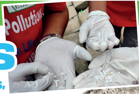
Left: The NGO ESDO found almost 100 nurdles on a sandy beach in Bangladesh in 2022.

hundreds of organisations, thousands of volunteers, trillions of nurdles, one goal.